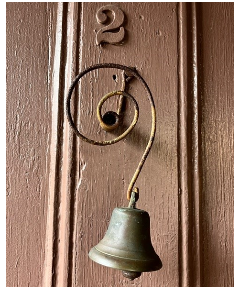
Bell on office door or the Old Schwamb Mill